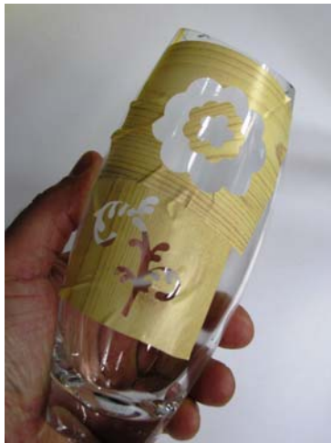
Peel the backing off of the contact paper and apply the mask. Make sure the edges are stuck down tight to the glass.