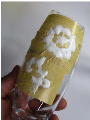
Apply the etching solution in the areas that you want to be etched and wait for about 10 minutes. Rinse the area well with water and remove the masking.