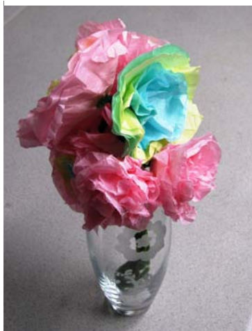
Finished project ... complete with paper flowers. (Love you Mom)

Project Description: This Etched Glass Vase is a perfect Mother's Day gift or it can be tailored to any special occasion.